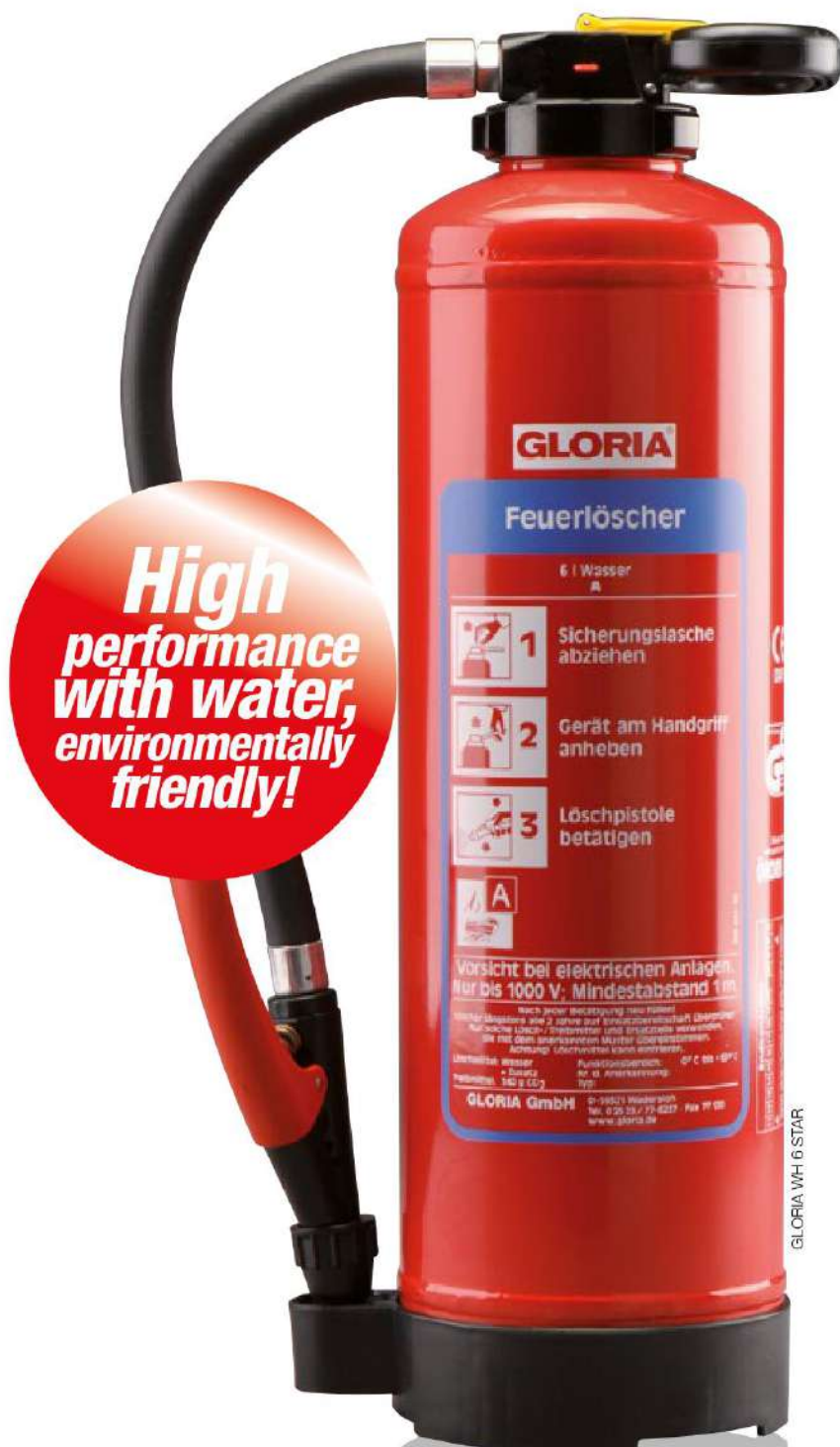
GLORIA WH 6 STAR

Serially equipped with quality wall bracket, appropriate car bracket is available separately.