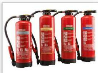
GLORIA STAR line family.