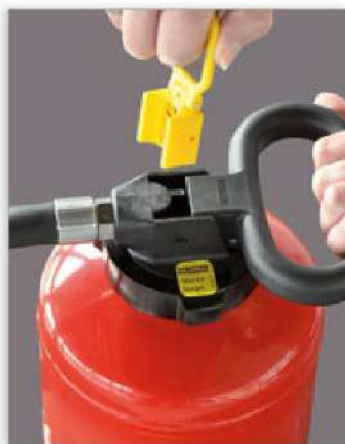
GLORIA STAR line - lifting the safety pin.