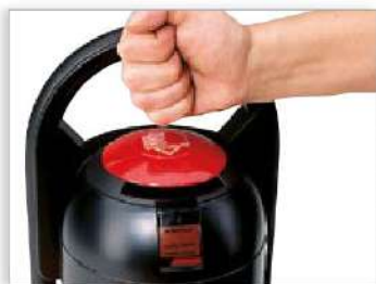
...or additionally via striking button in F 6 Ni+.