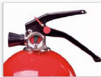
GLORIA PD 2 - valve look