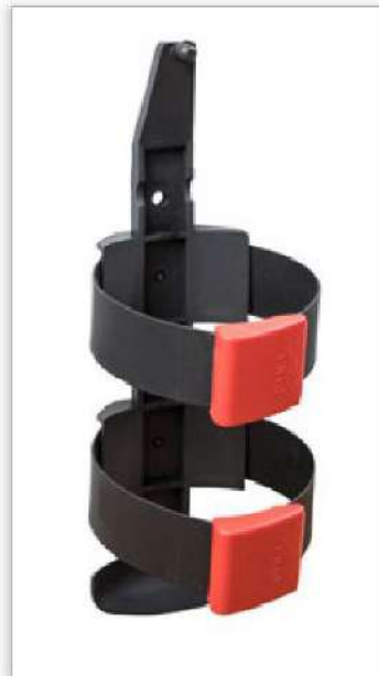
GLORIA's car bracket and patented security strap