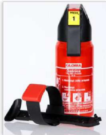
GLORIA P 1 with car bracket