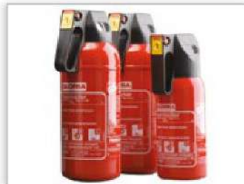
GLORIA P 1 and P 2 family