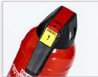
GLORIA P 2 GM