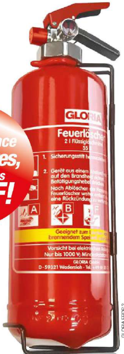
GLORIA FBDP 2

High performance on fat fires, Fire classes A/B/F!