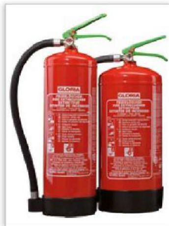
GLORIA SDE family