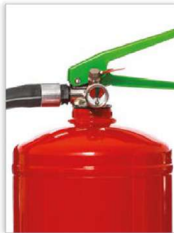
GLORIA SDE 6 - valve lock