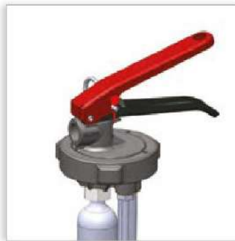
GLORIA EASY line - plastic valve body.