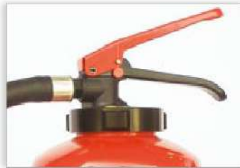
GLORIA SF 6 EASY - valve look.