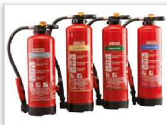
GLORIA PRO line family.