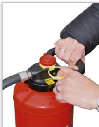
GLORIA WH PRO - safety pin.