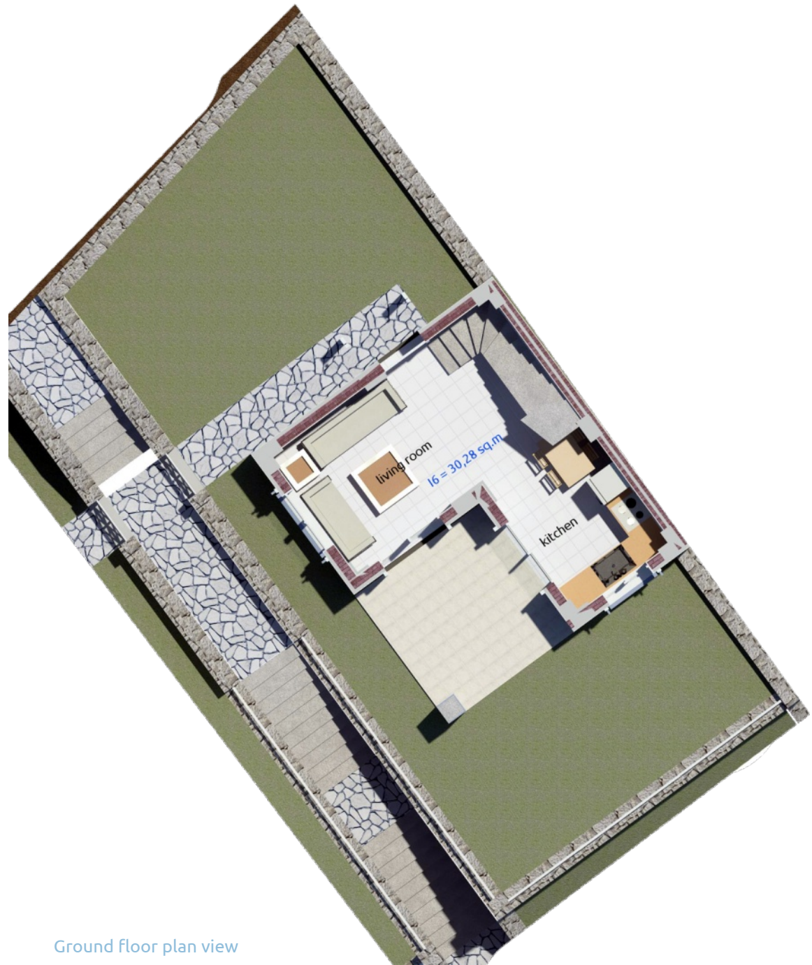
Ground floor plan view

Air-conditioning units are included in all major rooms.