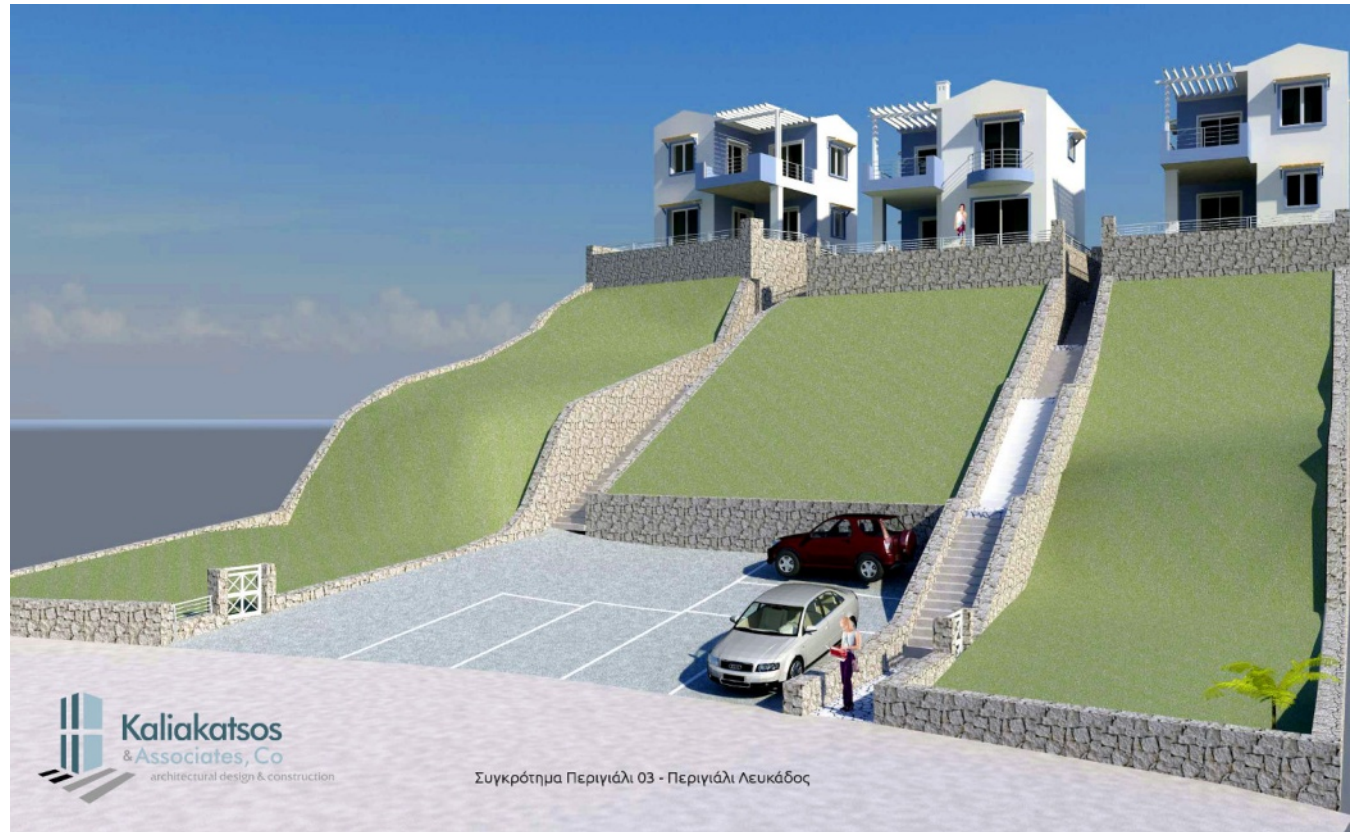
Rendering of the project, buiding 4 on the left and building 6 to the right

Three buildings, are constructed, all maisonettes. Available for sale are the maisonettes in buildings 4 and 6. They are completely autonomous, with their own outdoor space and are currently under construction.