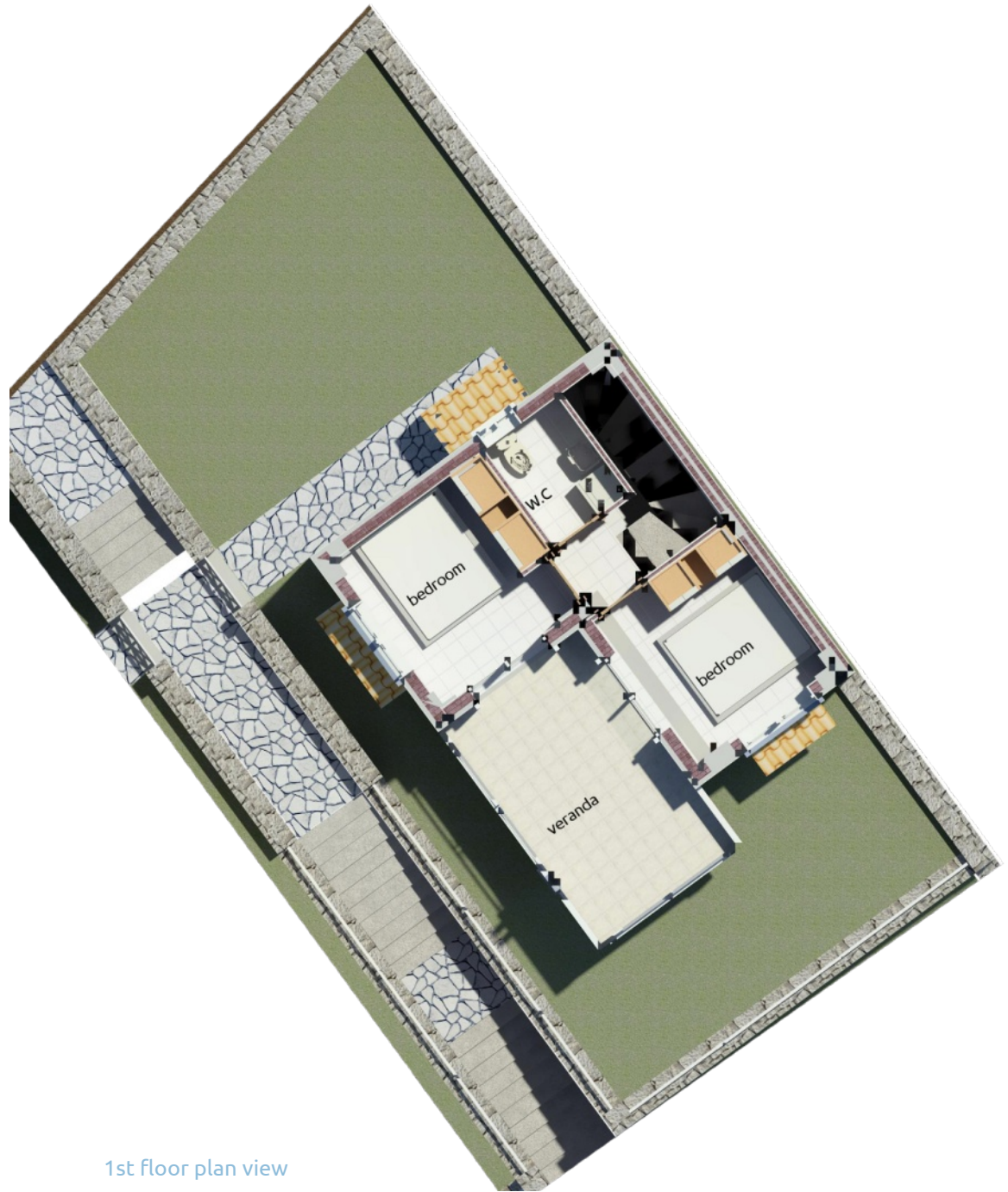
1st floor plan view